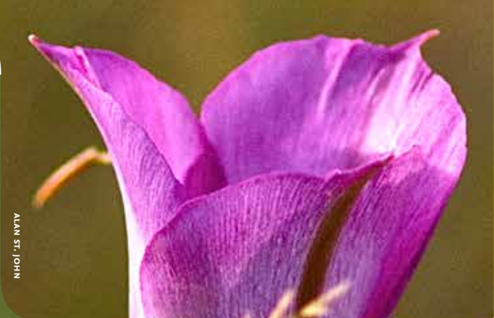
ALAN ST. JOHN

One of our showiest wildflowers lighting up hillsides with sunny, disk-like faces. Grows in clumps with large widely triangular leaves that have heart-shaped bases. Yellow flowers are 2 1/2 -4in wide on 1-3ft stems.