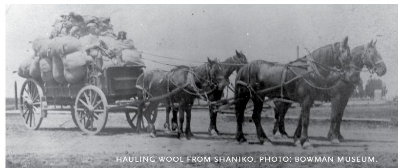
HAULING WOOL FROM SHANIKO.