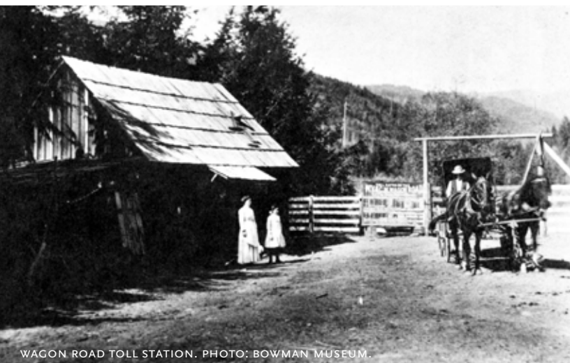
WAGON ROAD TOLL STATION.