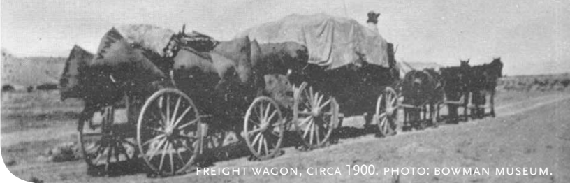
FREIGHT WAGON, CIRCA 1900.